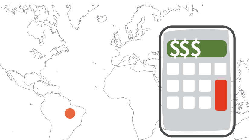
◀ Location of the Inequality Challenge's project: ● Brazil

Oxfam Brasil's 'Fair Share' project is a fiscal calculator which provides basic information on citizens' current individual position in the income distribution, their tax burden and the level of support and public services by the welfare state.